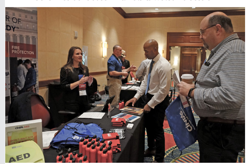
1.5 days to exhibit and network with attendees