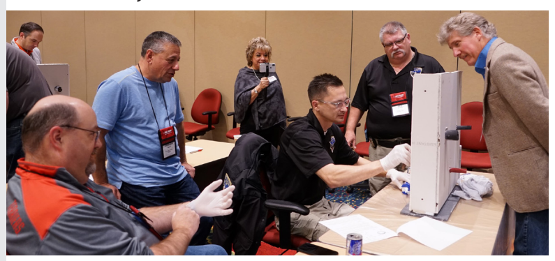
Hands-on Training (UL) and 2.5 days of presentations